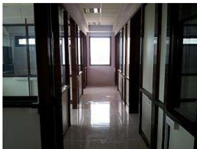
Cell Culture Facility - Overview