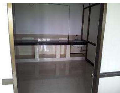
Microscopy Dark Room